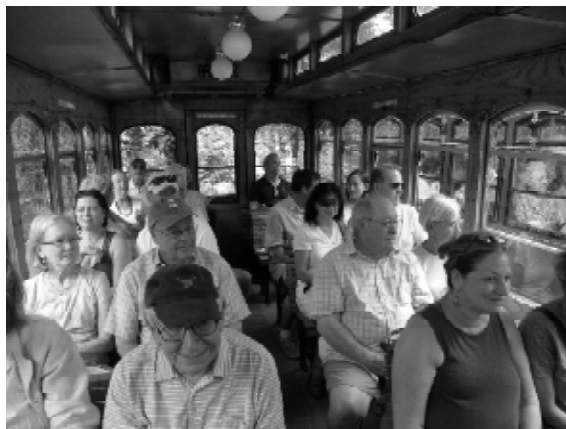
Some 90 guests boarded the air-conditioned trolleys to tour Revolutionary War sites in New Hope and Solebury.

We look forward to offering more joint programs with these two organizations and perhaps repeating this very popular event next summer.